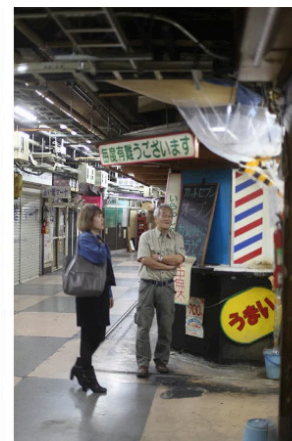
Left: Right