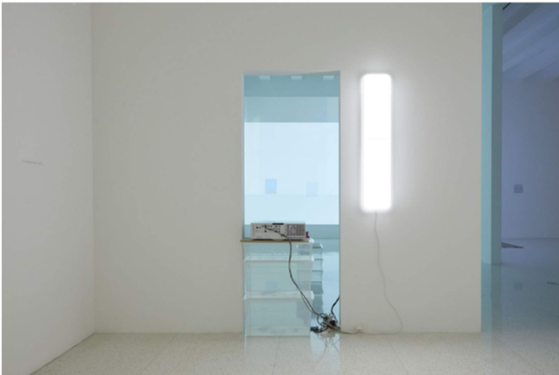
Installation view of Lee Kit: Hold your breath, dance slowly

“When we talk about places, we seldom consider our emotions,” Lee says. “People don’t often talk about emotions, particularly in art. They talk about concepts and ideas, but emotions are also very important. I’m not talking about expression. I’m referring to feelings that are subtle and often indescribable.” 1 Lee’s installations, or what he calls “situations,” can be described as meditations on feelings that are subtle and indescribable. Like emotions, the exhibition possesses a dematerialized presence that feels at once ethereal and embodied, imagined and very real. The works that inhabit the spaces are themselves fragile and ephemeral (digitally projected images permeate the installation; lightweight, translucent plastic bins are stacked up and scattered throughout the space; and paintings on cardboard and paper are casually tacked onto the wall). The modes of presentation also suggest a transience or impermanence (projected images fade into one another; passersby cast shadows onto the projection surfaces, the shadows ostensibly becoming a part of the experience of the artwork that is impossible to hold onto). There is no beginning, middle, or end, no narrative structure to grasp; instead, you get the sense that you have experienced an all-consuming sensation that, albeit pleasurable in the moment, begins to slip away the moment you walk back into the daylight.