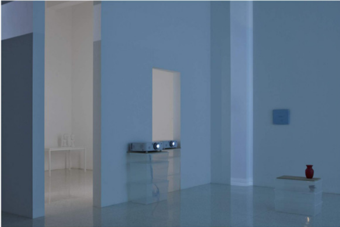
Installation view of Lee Kit: Hold your breath, dance slowly

This sense of familiarity resonates throughout the exhibition: When presented with the phrases “Fuck you” and “You feed yourself everyday” (transferred via inkjet onto a piece of cardboard or, in the case of the latter, at eye level directly onto the wall), you can easily imagine moments, the most private of moments, when you might look up into the bathroom mirror after washing your face and, assessing your reflection, offer up words of uncharitable condemnation or, if in a more generous spirit, of self-encouragement.