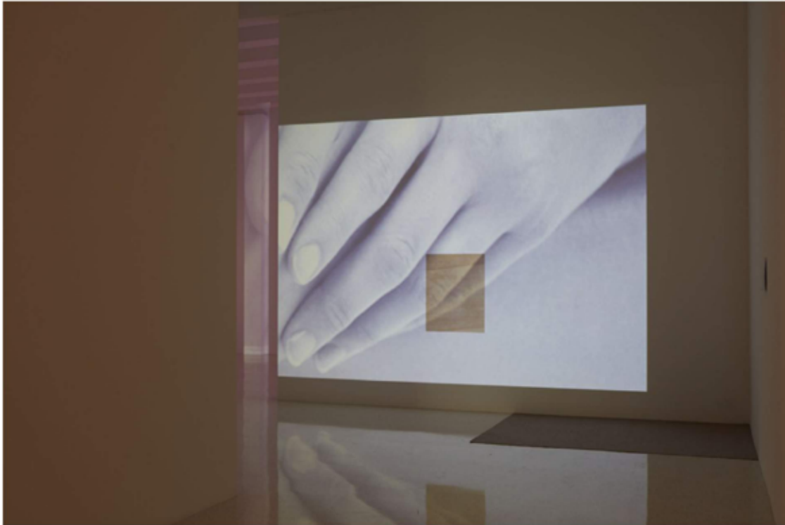
Installation view of Lee Kit: Hold your breath, dance slowly

Using floor lamps and the soft light that spills over from the many projections that punctuate the gallery, Lee casts a warm glow on the unremarkable actions we tend to perform behind closed doors: The works in the show incorporate objects of an intimate nature, ranging from bathroom products (Nivea cream, Smith's lip balm, Johnson's baby oil, etc.) to a shower stall situated in a corner of the exhibition. Beyond these direct references to commonplace consumer products, his works more broadly evoke the daily regimen of personal hygiene and care that we conduct in private. We are shown fragments of hands and soles of feet, body parts that heighten our sensations of touch and which we can imagine caressing with the various creams and lotions alluded to throughout the exhibition.