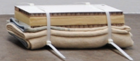
Brendan Earley Don't look back Aluminium, perspex, mahogany 148 x 52 x 13 cm 2010 Kevin Cosgrove Workshop (with cardboard) Oil on linen 45 x 55 cm 2011 Brendan Earley They bedded down for the night Woollen blanket, foam, plastic ties, melamine 16 x 61 x 47 cm 2011