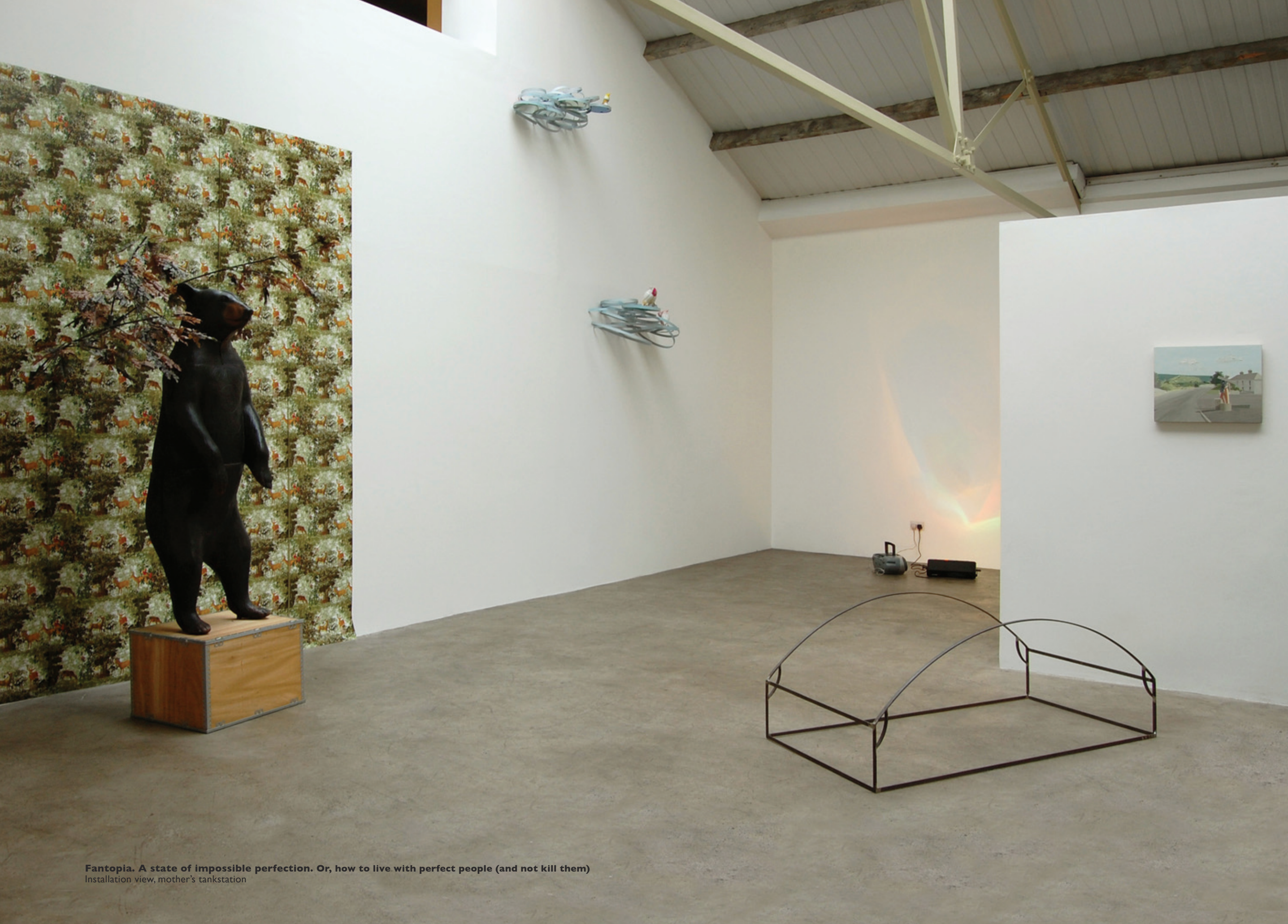
Fantopia. A state of impossible perfection. Or, how to live with perfect people (and not kill them) Installation view, mother's tankstation