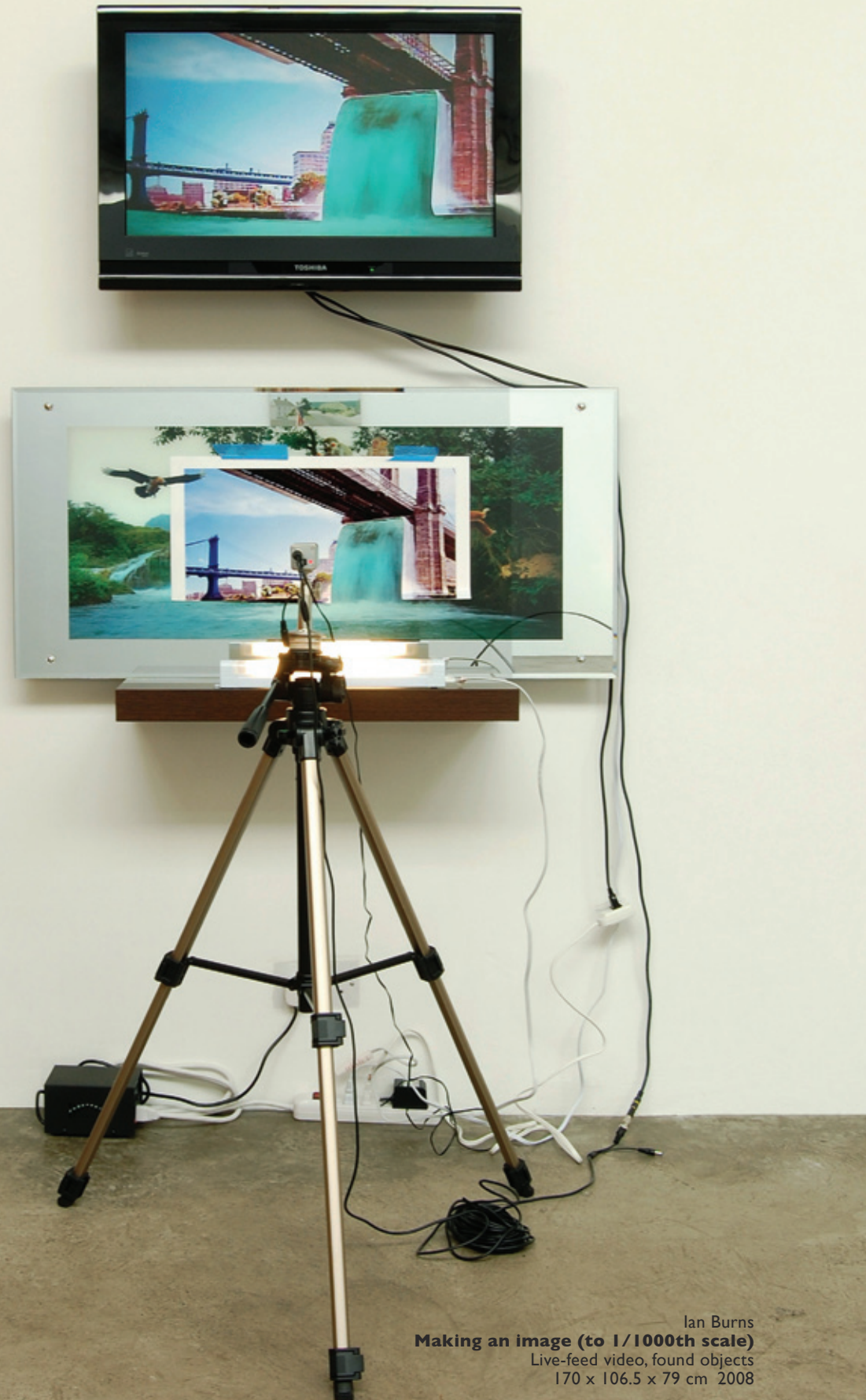
Ian Burns Making an image (to 1/1000th scale) Live-feed video, found objects 170 x 106.5 x 79 cm 2008

In Ian Burns' Making an Image (to 1/1000th scale) , Olafur Eliasson's man-made waterfall shimmers beneath the Brooklyn Bridge like a Shangri La. Burns' recreation is a convoluted assemblage consisting of live feed video, cut outs, sticky tape and the type of animated picture that you might see in a Chinese restaurant. The mechanics behind the illusion are laid bare, as were Eliasson's – from the visible scaffolding to the pipes and pumps that pulled water from the East River and out again. In both pieces, there is the paradox