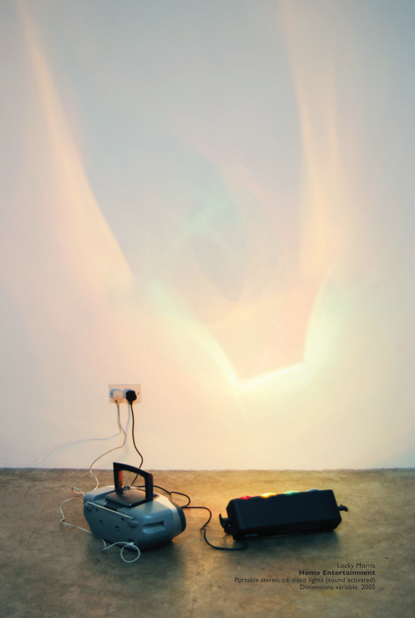
Locky Morris Home Entertainment Portable stereo, cd, disco lights (sound activated) Dimensions variable 2005

of knowing you are being tricked but allowing your disbelief to be suspended anyway. Burns' image looks out from the Brooklyn side of the river onto the cityscape of Manhattan to a view that would have previously included the Twin Towers. Once their absence is noted, the scene takes on new and paradoxical meanings, Eliasson's attempt at a moment of sublimity co-existing alongside painful memories of 9/11.