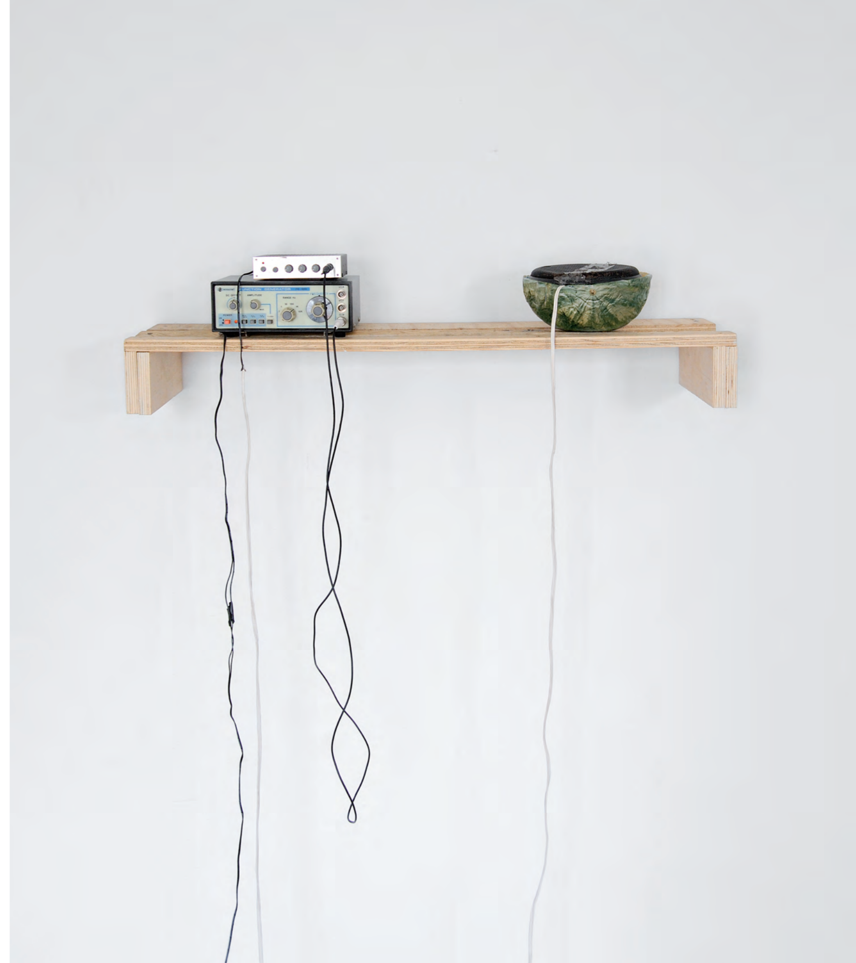
TO BE HIDDEN AND SO INVISIBLE (21000Hz) SUBLIMATED WATERMELON, FUNCTION GENERATOR, AMPLIFIER, SPEAKER, WOOD, CABLE 23 X 92 X 26 CM 2009 AMC COLLEZIONE COPPOLA