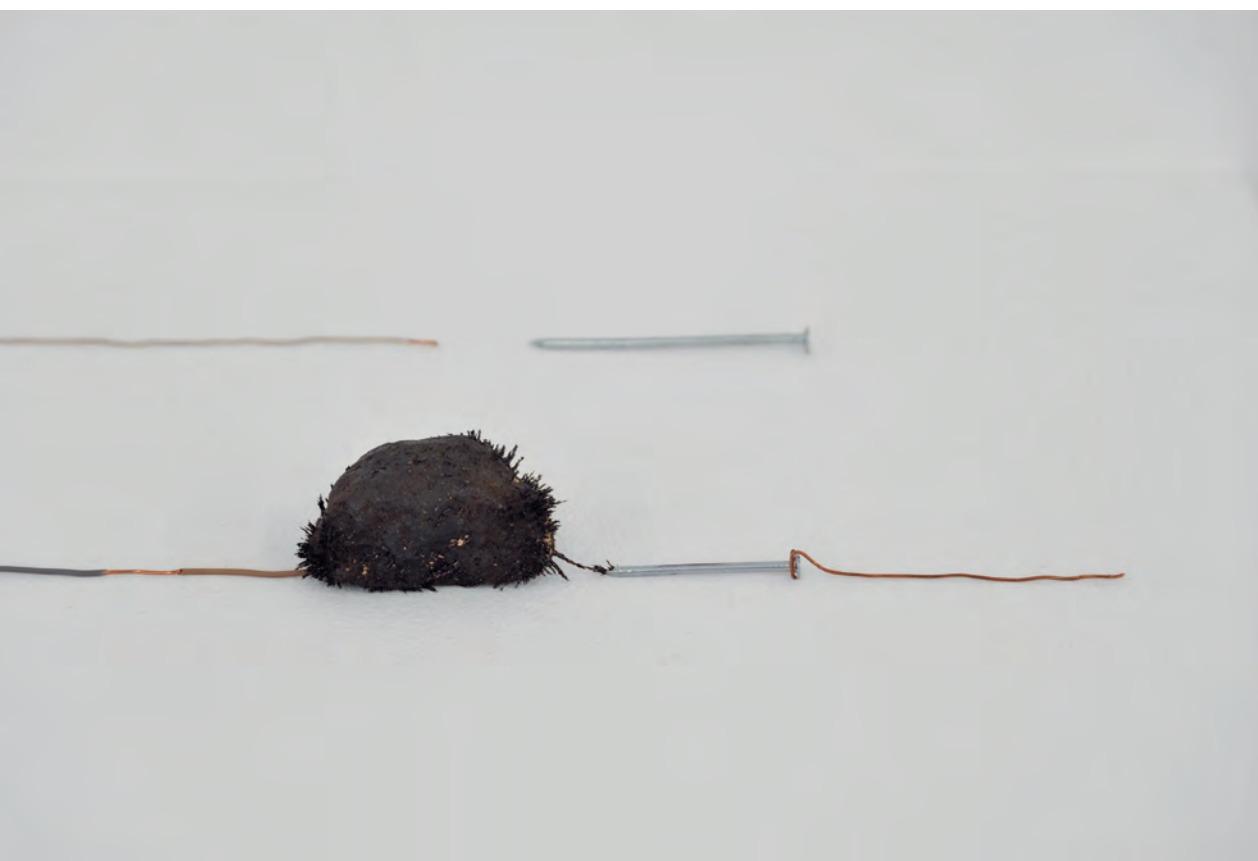
DIAGRAM FOR A CONDUCTOR NAILS, WIRE, CABLE, LODESTONE, IRON FILINGS 50 x 25 x 5 CM 2011 COURTESY THE ARTIST, KONRAD FISCHER GALERIE, MOTHER'S TANKSTATION, GALERIE WIEN LUKATSCH

WAVE TUNING FORKS 70 x 5 x 15 CM 2010 COLLECTION OF PAMELA AND ARTHUR SANDERS