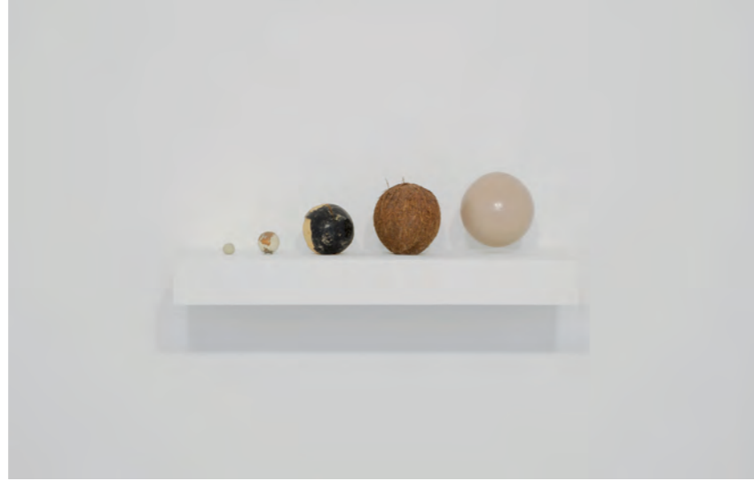
WAITING FOR A SPARK COAGULATED AIR, PETRIFIED WOOD 90 X 40 X 40 CM 2010 AMC COLLEZIONE COPPOLA