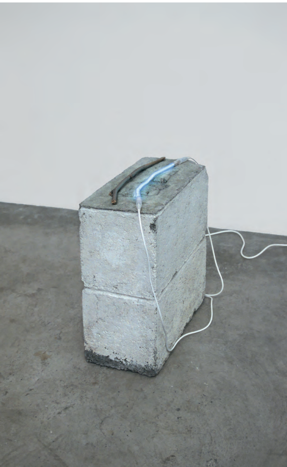
DEAD HEAT STICK, NEON, CONCRETE, CABLE, 1000V 47 X 44 X 21 CM 2008 AMC COLLEZIONE COPPOLA