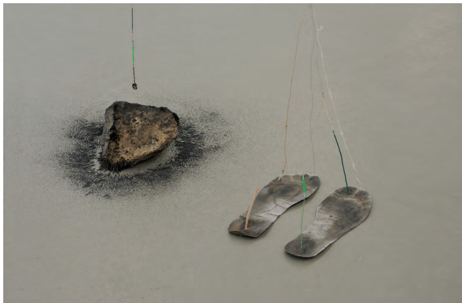
SHEPHERD'S FEET LODESTONE, IRON FILINGS, ELASTIC BANDS, SOLES, WOOL, WIRE, TAPE, NAIL, MAGNET 30 X 60 X HEIGHT VARIES WITH CEILING 2010 AMC COLLEZIONE COPPOLA