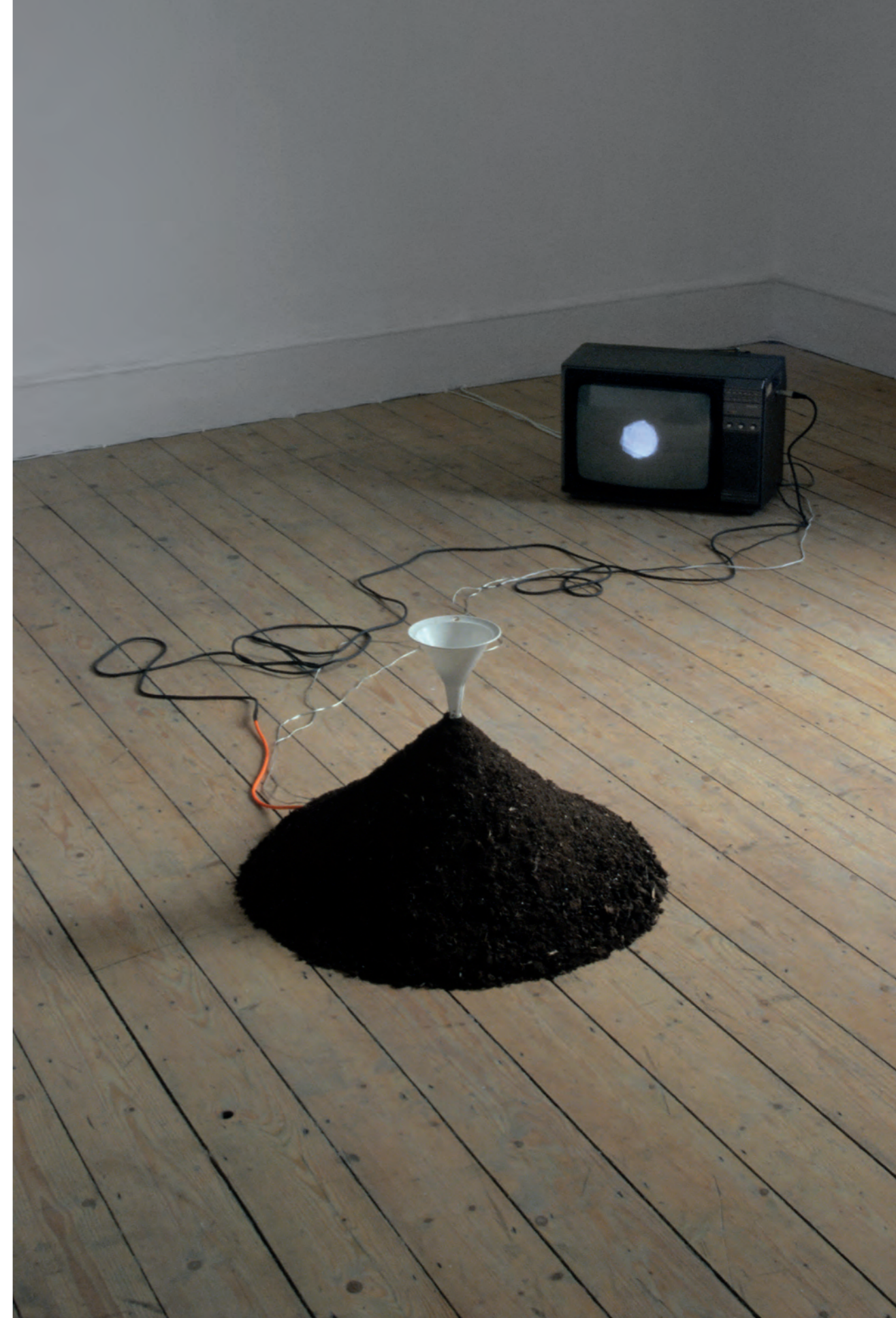
MOON SCULPTURE ANIMATION (10MIN 00SEC), MONITOR, DELAY MODULE, 20 LITRES OF SOIL, SPEAKER, FUNNEL, HOSE, CABLE DIMENSIONS VARIABLE 2007 AMC COLLEZIONE COPPOLA