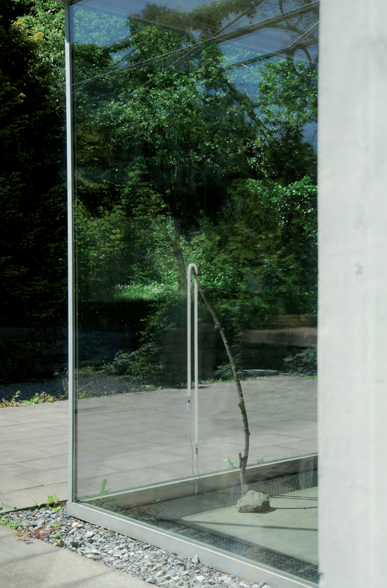
WINTER WORK STONE, STICK, NEON, CABLE, 2000V 130 X 45 X 10 CM 2009 PRIVATE COLLECTION, DÜSSELDORF