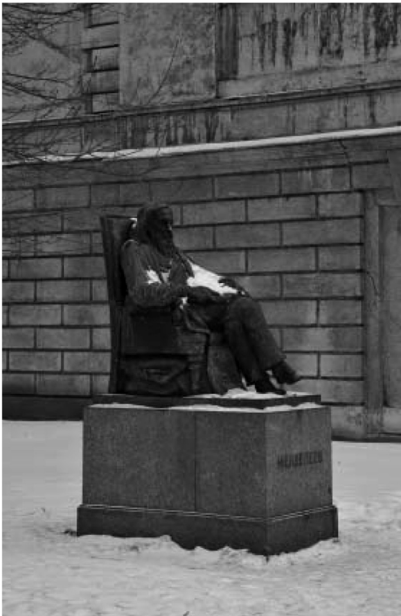
Statue of Dmitri Mendeleev, St. Petersburg, Russia

The story of Mendeleev's dream is a story of an attempt to dream the nature of matter. It is, of course, not Mendeleev's dream, or not his exclusively, but ours – the dream that knowledge can come in a dream, understanding delivered in abrupt, absolute and irreversible revelation. Our dream of Mendeleev's dream is a dream that insists on actuality, punctuality, the here and now, on the possibility of a pure moment of breakthrough that can be isolated from all preceding and succeeding moments, on the idea of time, as Beckett put it, as a laminar process of 'decantation from the vessel containing the fluid of future time, sluggish, pale and monochrome, to the vessel containing the fluid of past time, agitated and multicoloured by the phenomena of its hours'. Beckett 1965, 15 It insists, in the midst of this process, on the