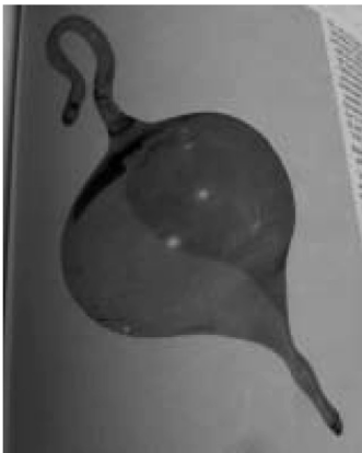
Reproduction of Marcel Duchamp's Air de Paris (1919)

that things are the way they are and not some other way. There is more magic in the thought that there is no magical thinking than in the thought that there is, more power in the thought that can overcome its own desire for the overcoming of the real than the thought enslaved by the dream of its own freedom.