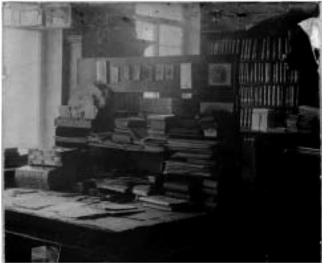
Mendeleev's study, 1860s, St. Petersburg, Russia

absolute immunity of the isolable moment – its thisness, or inertness. It is time conceived as a noble gas, noble because it involves no mixing or mingling, no compounding of past and present, no hoipolloi-hobnobbing.