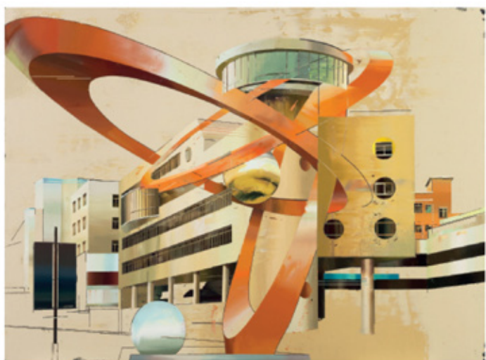
THIS PAGE ABOVE Untitled (Project Japan) #7 , 2014, inkjet on magazine page, 24 × 18 cm. Courtesy: the artist and Leo Xu Projects, Shanghai

“To Western theorists, East Asia’s rapid urbanization has come to epitomize what Rem Koolhaas dubbed, in the 1990s, the ‘generic city.’”