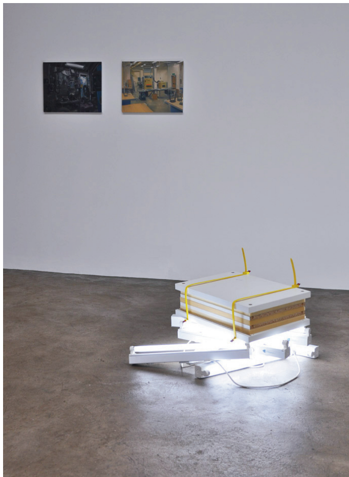
Kevin Cosgrove & Brendan Earley: Nor for Nought , installation view, 2011 (Foreground: Brendan Earley: All the Lights are On , reassembled IKEA kitchen, plastic ties, foam, fluorescent tubes, 2011); Image courtesy mother's tankstation and the artists.

sheet of black glutinous perspex is overlaid. It is infuriating both formally and ergonomically. And yet it is here that the work is interesting: to hide away that which is most valued is to run counter to economic expectations. Function does not come into the equation, but rather a dominant expectation founded on the consumerist predicate; in any case, to use mahogany here simply seems wholly function-less – MDF would have done the job just as well. It is not dissimilar to the approach taken by Cosgrove in his paintings, as he meticulously paints, pointedly in oils, spaces in which nothing is happening, or machines which at the moment he paints them, have ceased to function. A prevailing disinclination towards light and contrast – most of the works are of a similar breed tonally – further iterates the humdrum quality of these spaces and things. And yet he works towards representation of these scenes, running counter to an expectation of what, really, a painting should be. This is still life in the truest sense, empty of people, devoid of activity, and thus still yet a site of possible creation or epiphany. Another work, Workshop (with cardboard) (2011), shows a grimy workshop, all gnarled