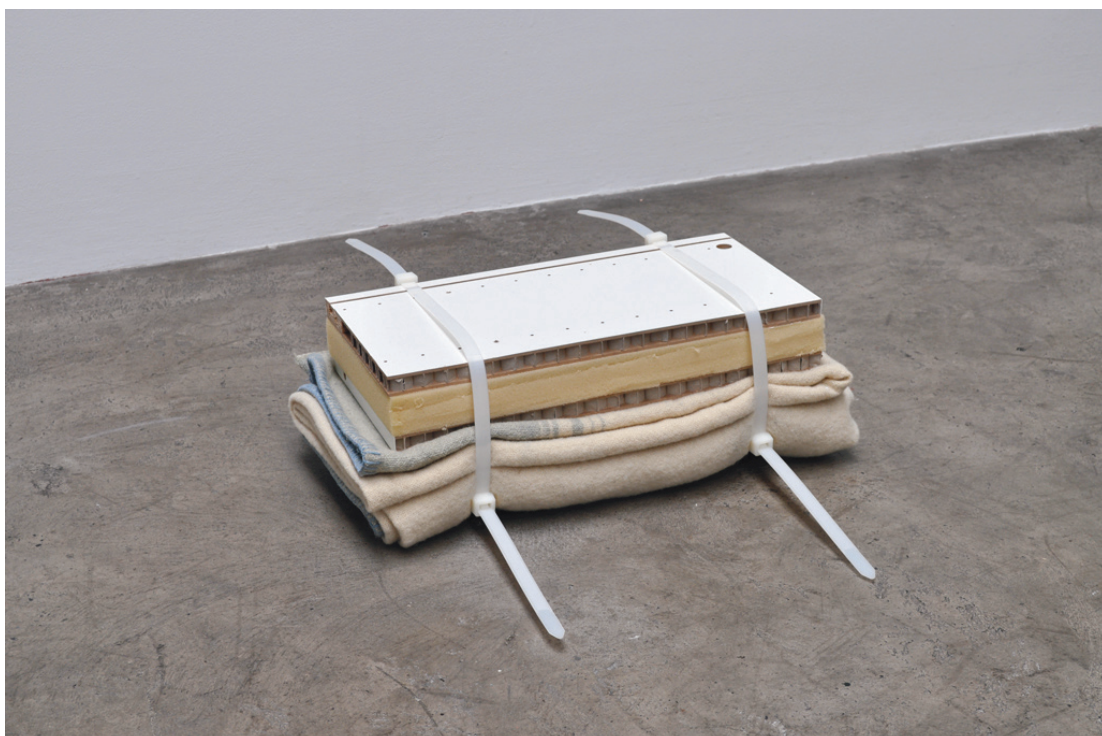
Brendan Earley: They Bedded Down for the Night , woolen blanket, foam, plastic ties, melamine, 2011